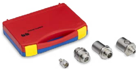
Reliable connections with bushing adapters (depicted with included case)

Accessories to partial discharge measurement products