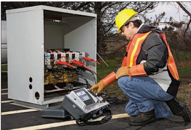
TTR330 shown testing a pad mount three-phase transformer