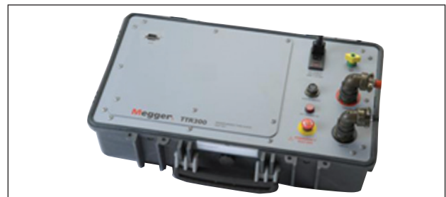
TTR300 — remote controlled "black box" unit