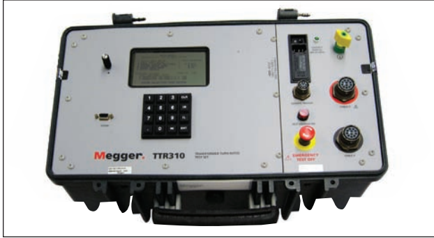
TTR310 — text-based LCD interface unit