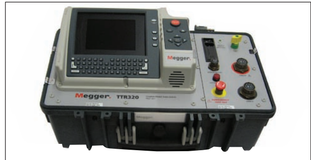
TTR320 — graphical ICON based user interface unit