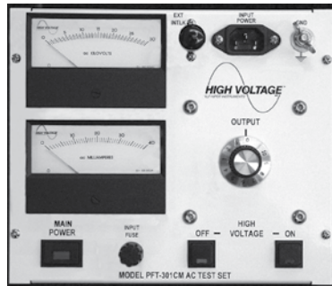
PFT-301CM Control Layout

Note: For 230 volt line input, an F is suffixed to the model number.